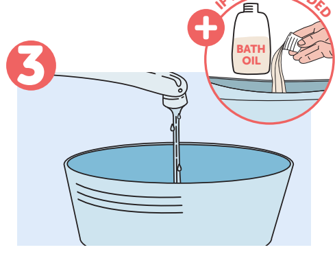
Half fill a large mixing bowl with slightly warm water. If recommended, add 1 capful of bath oil.