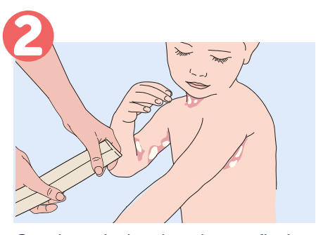
Cut the tubular dressing to fit the child's arms and legs.