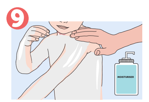
When you remove the wet dressings apply moisturiser to the entire body and face.