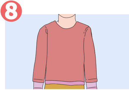
Put dry clothing over the wet clothing on your child.