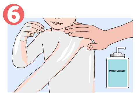
You may also be advised to apply moisturiser under the wet dressings. If this is the case, apply the moisturiser to the whole body and face.