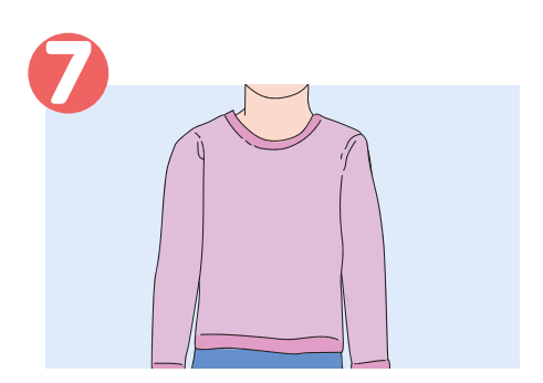
Put the wet singlet and tubular dressings on your child.